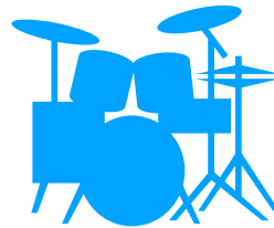
Full drum kit